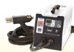
PROLINER ALU PRO FV - ref. 035836