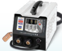
PROLINER PRO 230 - ref. 035799 PROLINER PRO 400 - ref. 035805