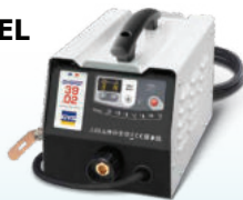
PROLINER 39.02 - ref. 035775 PROLINER 39.04 - ref. 035782