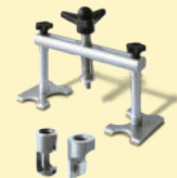
Alu Puller ref. 051003