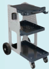
Spot 800 trolley ref. 051331